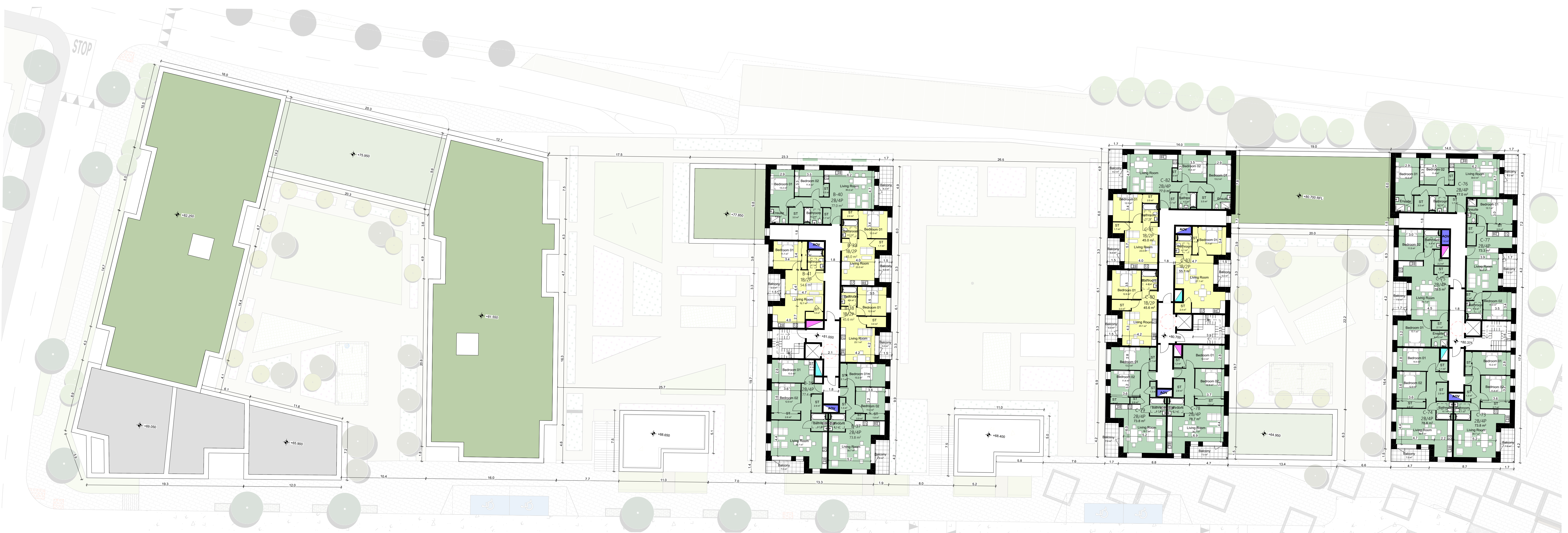
SIXTH FLOOR PLAN SCALE 1:200

Notes Do not scale from this drawing. Use figured dimensions only. All errors and omissions to be reported to the Architect. This drawing is to be read in conjunction with relevant consultant's drawings. All dimensions are in millimetres and all levels are in meters to match Datums unless otherwise noted.